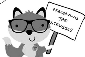
Archie the Archivist

We hope you enjoy the 2019 Sacramento Archives Crawl!